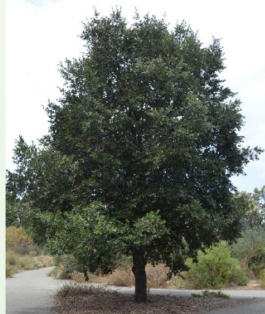
Canyon Live Oak