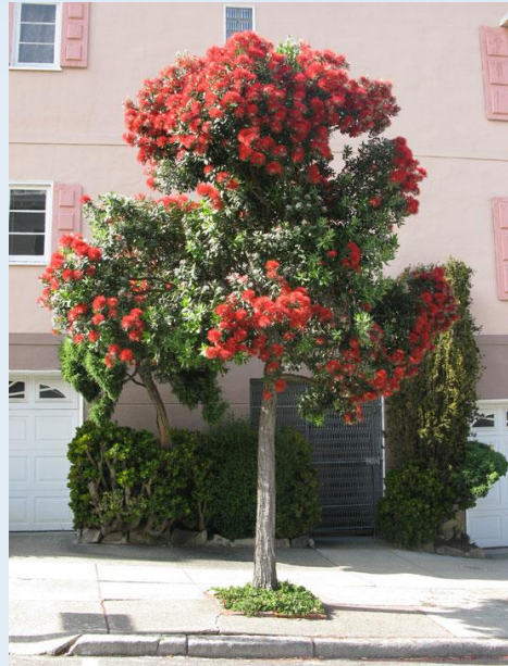
New Zealand Christmas Tree