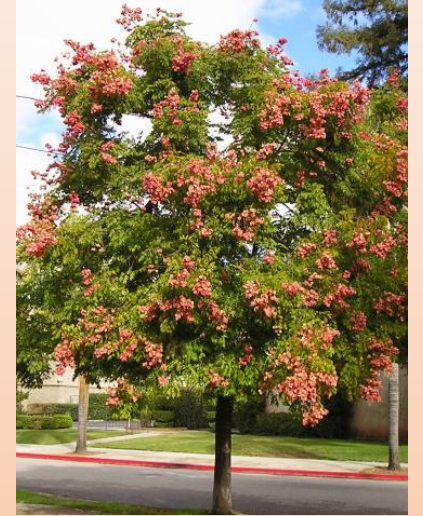
Chinese Flame Tree