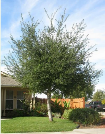
Coast Live Oak