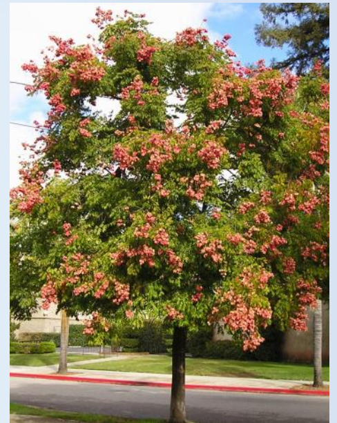
Chinese Flame Tree