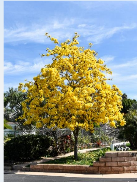
Golden Trumpet Tree