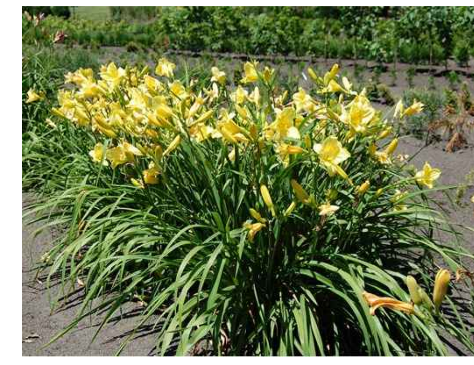
Hemerocallis x. 'Evergreen Yellow' Daylily 1-2'H X 1-2' W Moderate to High Water Use