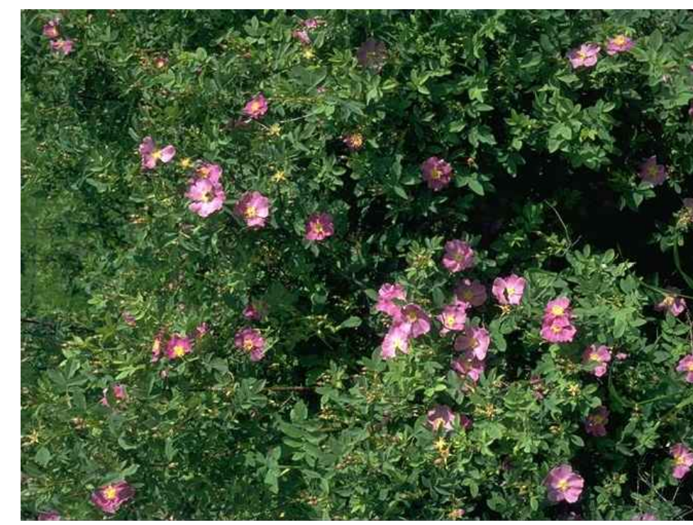
Rosa californica California Wild Rose 3'H X 3-9' W Low Water Use