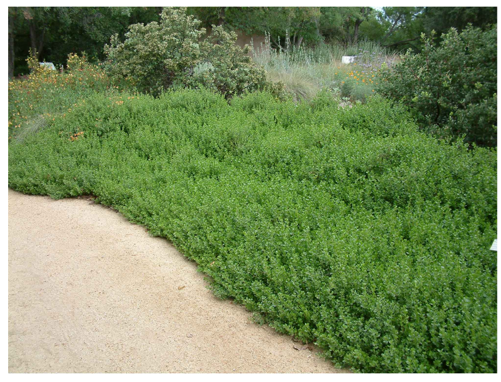
Baccharis pilularis 'Pigeon Point' Coyote Brush 1-2'H X 8' W Low Water Use