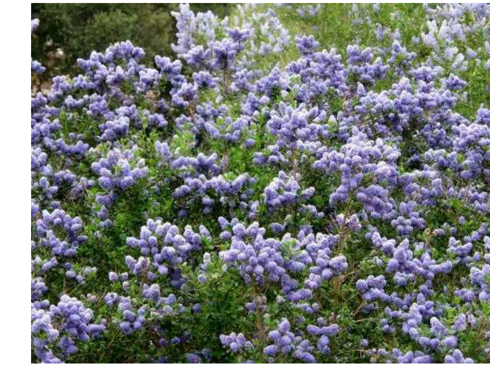
Ceanothus x. 'Celestial Blue' Celestial Blue Ceanothus 5-6'H X 6-8' W Very Low Water Use