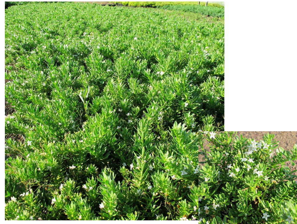
Myoporum parvifolium 'Putah Creek' Putah Creek Myoporum 12'H X 6-10' W Low Water Use