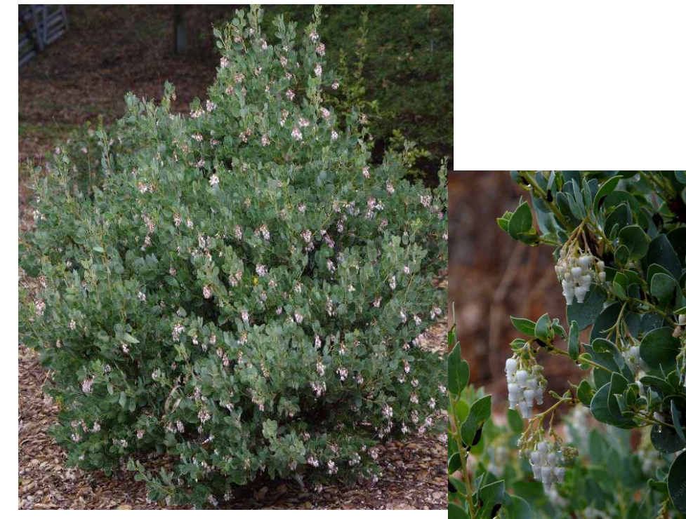
Arctostaphylos glauca 'Ramona' Ramona Manzanita Big Berry 4-8'H X 4-8' W Very Low Water Use