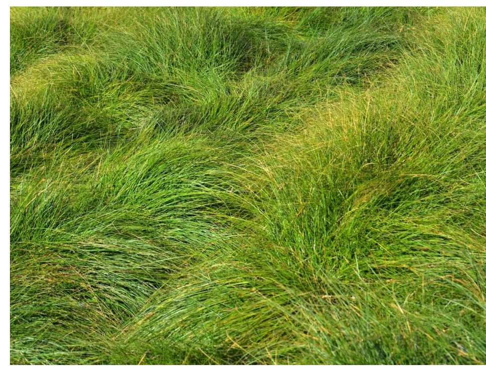
Carex pansa Sanddune Sedge 12'H X Spreading Moderate Water Use