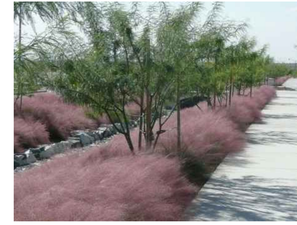
Muhlenbergia capillans 'Regal Mist' Muhly 4'H X 4' W Low Water Use