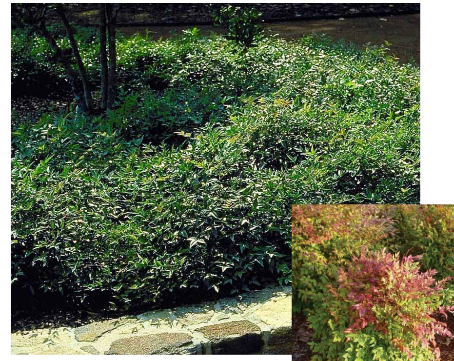
Nandina domestica 'Harbour Dwarf' Harbour Dwarf Heavenly Bamboo 18'H X 2' W Low Water Use