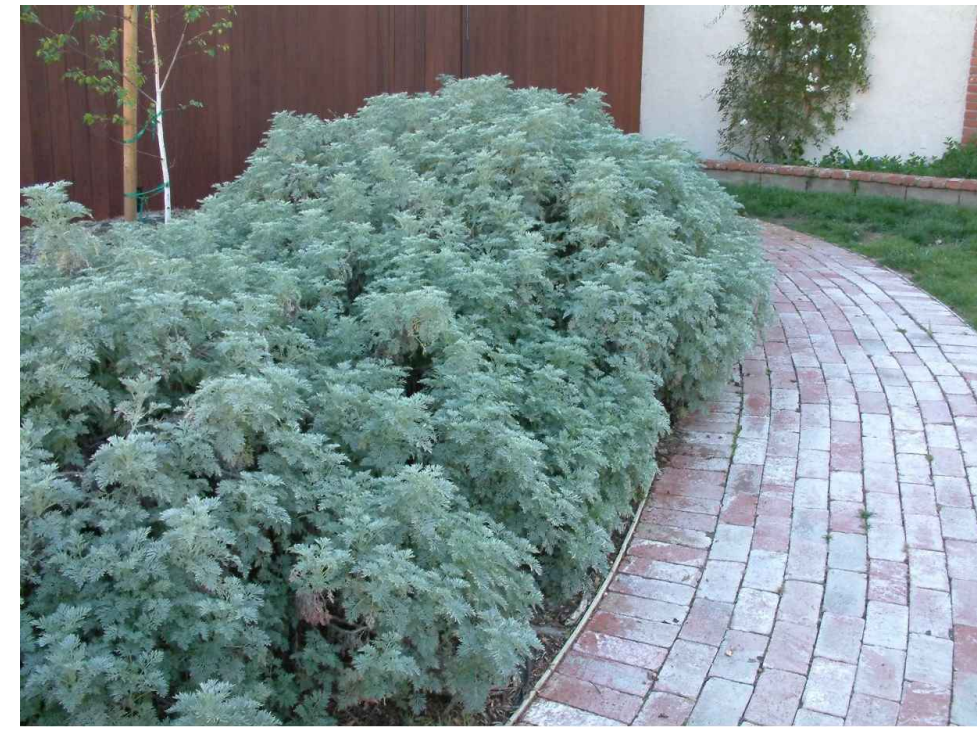
Artemisia x. 'Powis Castle' Powis Castle Artemisia 2-4'H X 4-6' W Low Water Use