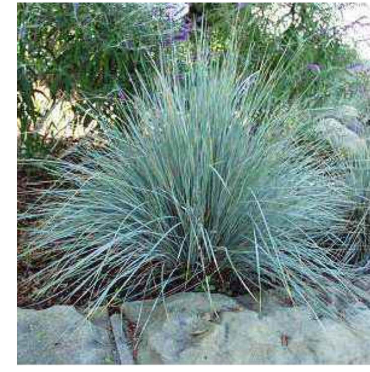
Helictotrichon sempervirens Blue Oat Grass 1-2'H X 1-2' W Low Water Use