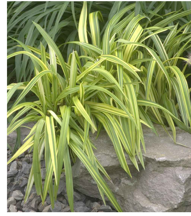
Dianella tasmanica 'Yellow Stripe' Golden Flax Lily 2-4'H X 2-3' W Low Water Use