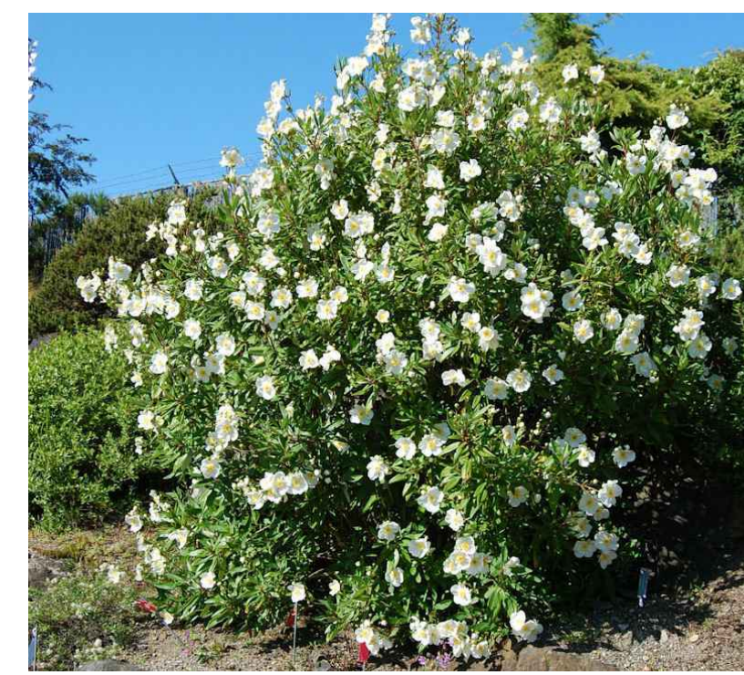
Carpentaria californica Bush Anemone 6-8'H X 4-5' W Low Water Use