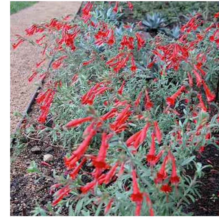
Epilobium canum 'Catalina' Hummingbird Trumpet 3-4'H X 4-5' W Very Low Water Use