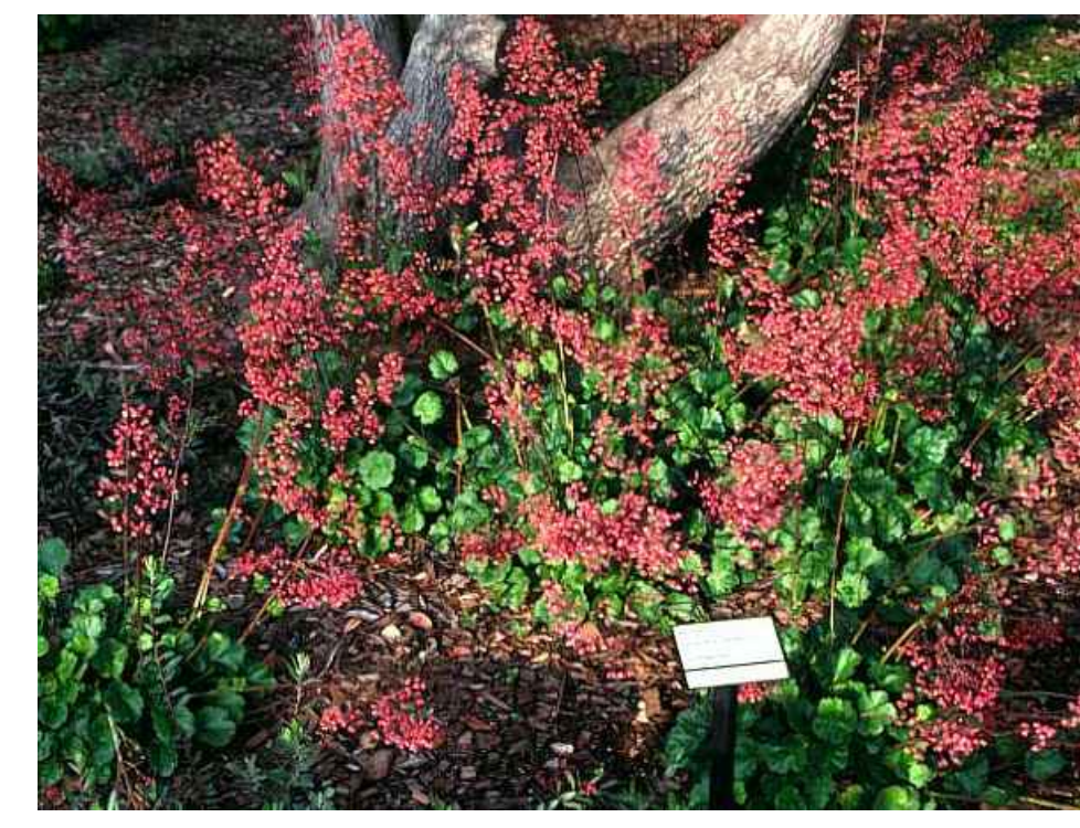
Heuchera x. 'Santa Ana Cardinal' Coral Bells 1-2'H X 1-2' W Moderate Water Use