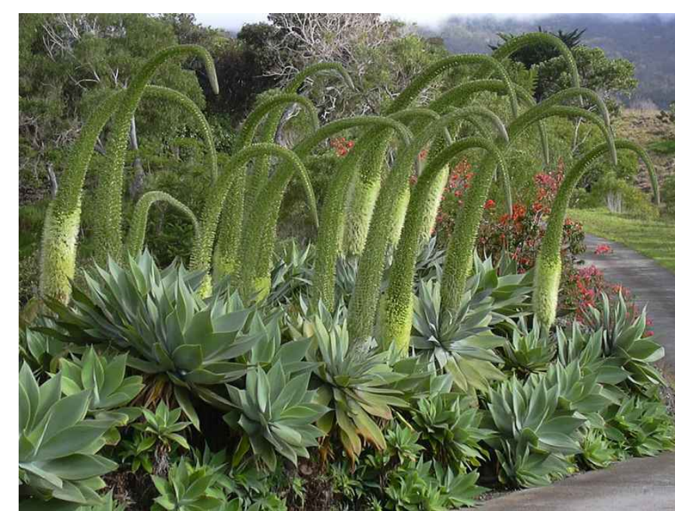
Agave attenuata Agave 4-5'H X 6-8' W Very Low Water Use