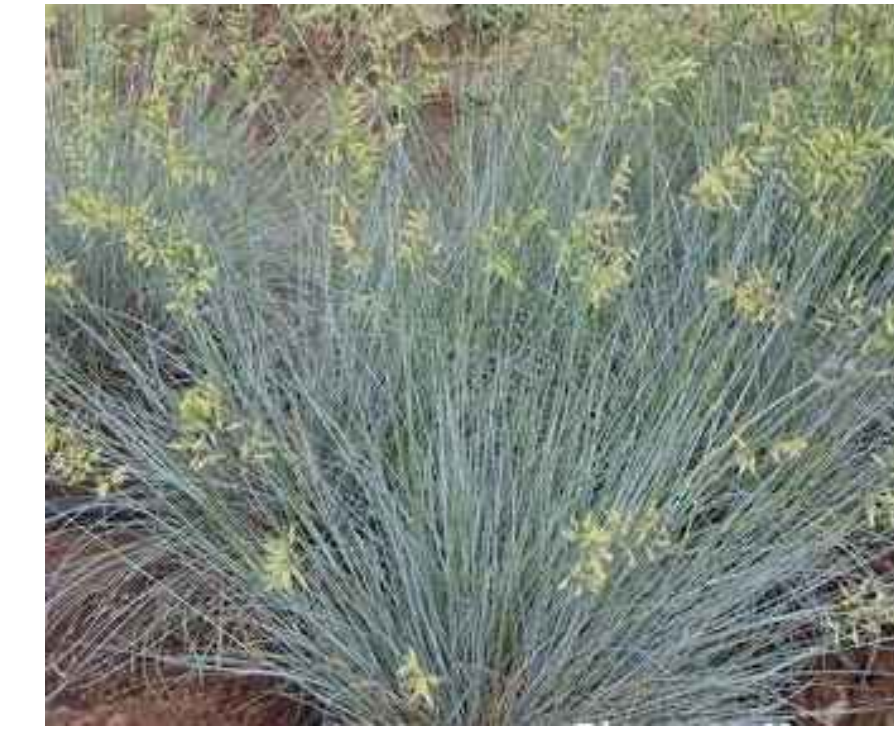
Festuca idahoensis 'Siskiyou Blue' Siskiyou Blue Fescue 1-2'H X 1-2' W Low Water Use