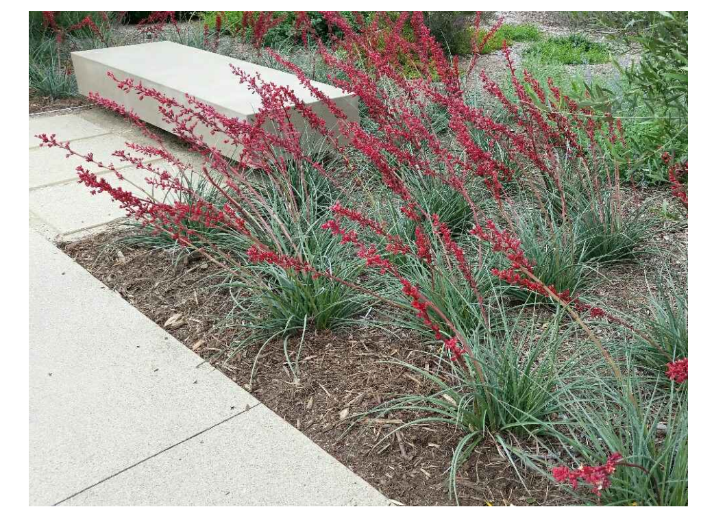
Hesperaloe parviflora 'Brakelights' Brakelights Red Yucca 2-3'H X 2-3' W Very Low Water Use