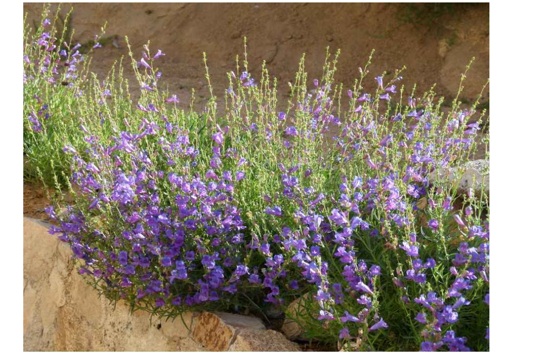
Penstemon heterophyllus 'Marganta Bop' Beard Tongue 1-3'H X 1-2' W Moderate Water Use