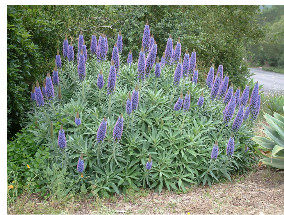
Echium candicans Pride of Madeira 4-6'H X 4-6' W Low Water Use