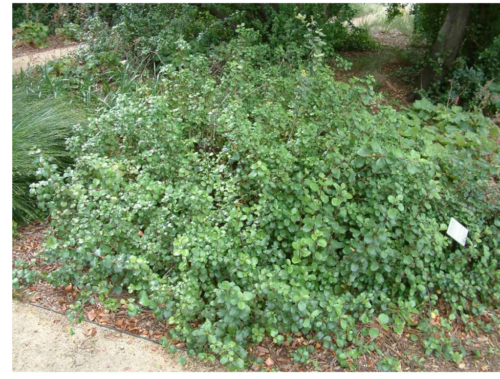
Ribes viburnifolium Evergreen Currant 3-4'H X 4-6' W Very Low Water Use