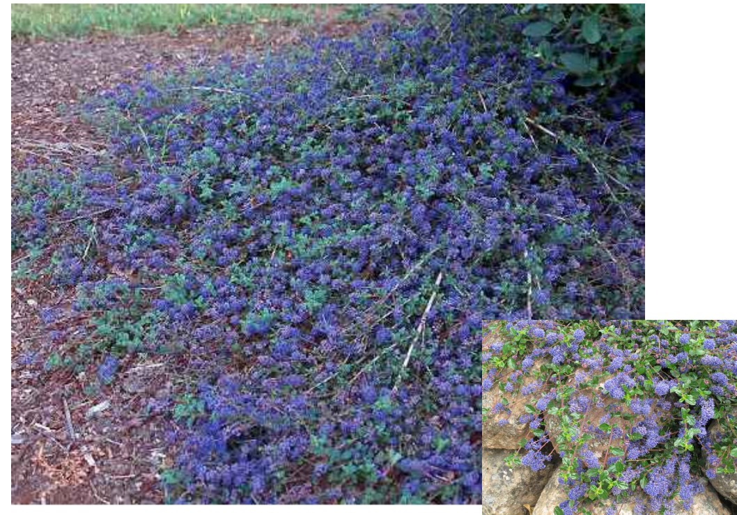
Ceanothus 'Centennial' Centennial Wild Lilac 12'H X 4-6' W Very Low Water Use