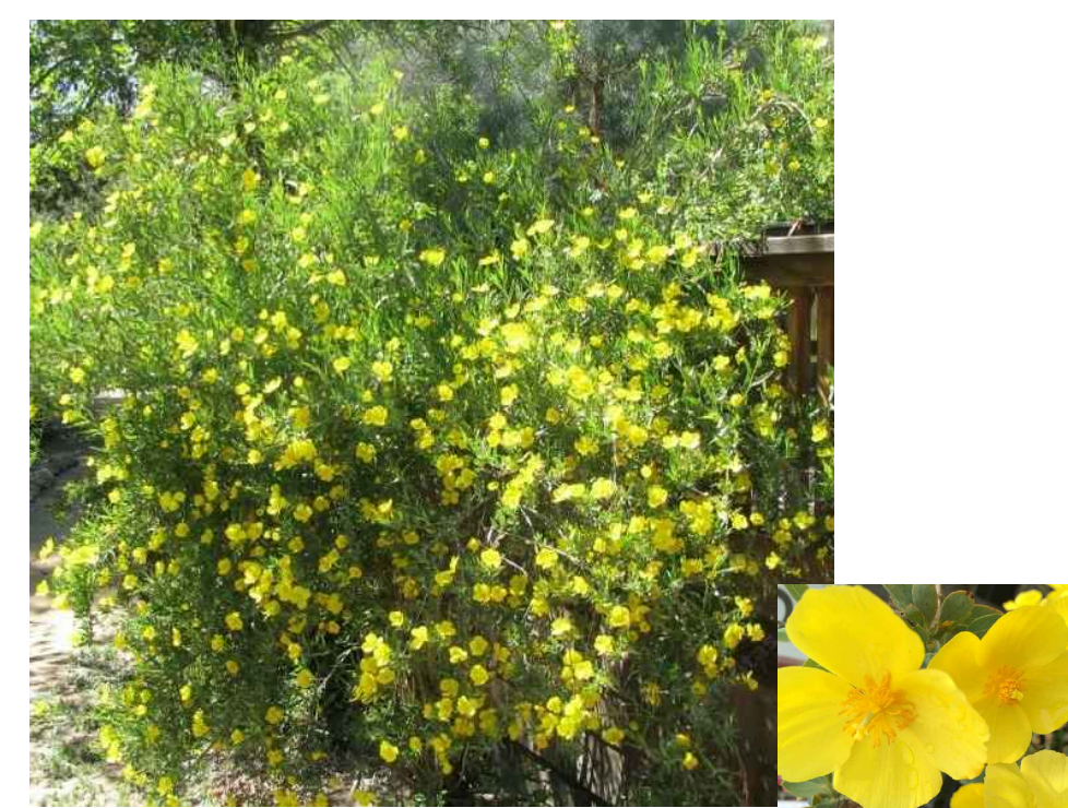
Dendromecon rigida Coral Aloe 3-6'H X 3-6' W Very Low Water Use