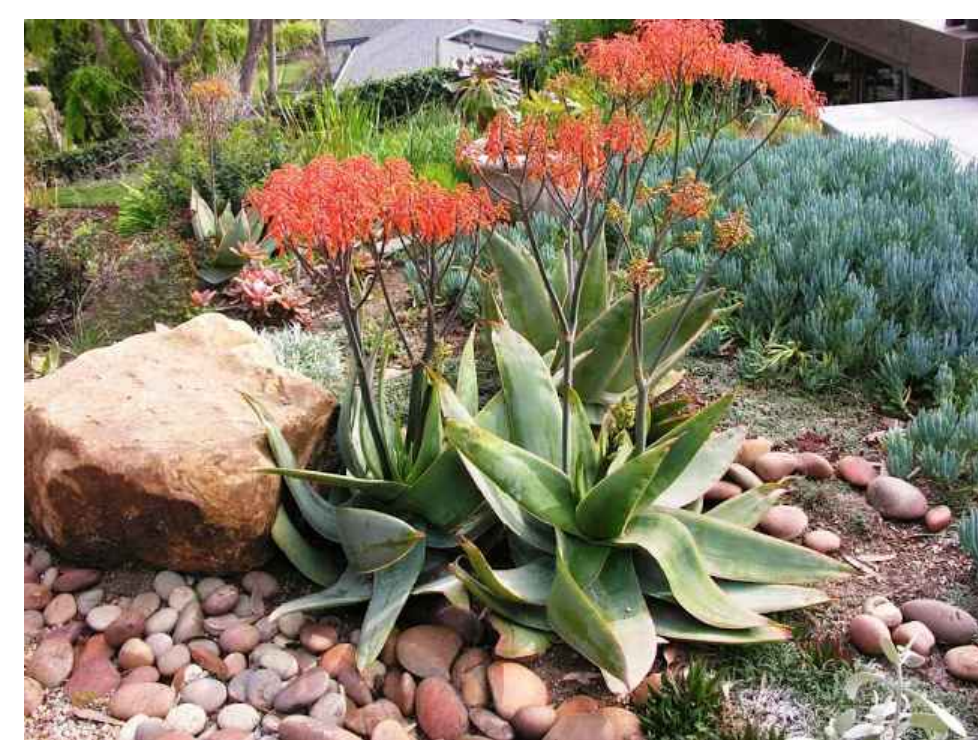
Aloe striata Aloe 2-3'H X 1-2' W Very Low Water Use