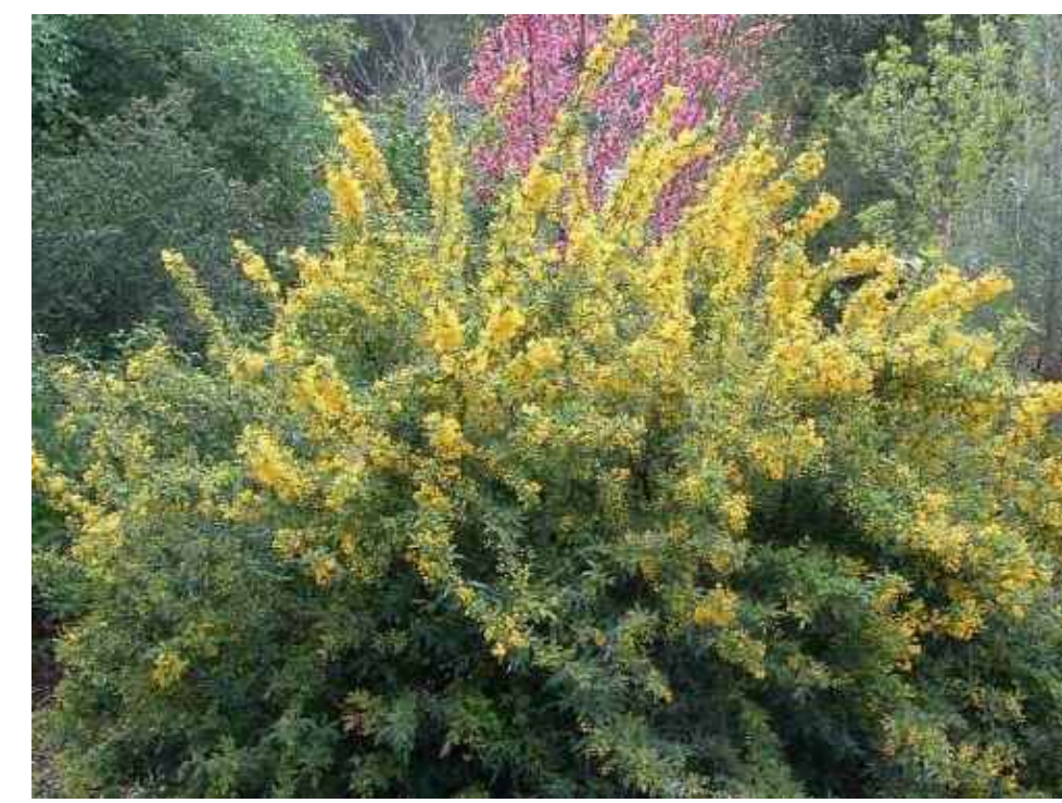
Berberis nevadensis Nevadensis Barberry 6-10'H X 6-12' W Very Low Water Use