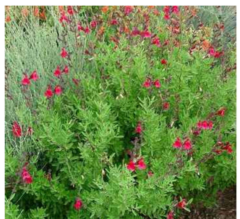
Salvia greggii 'Furman's Red' Furman's Red Salvia 2-3'H X 2-3' W Low Water Use