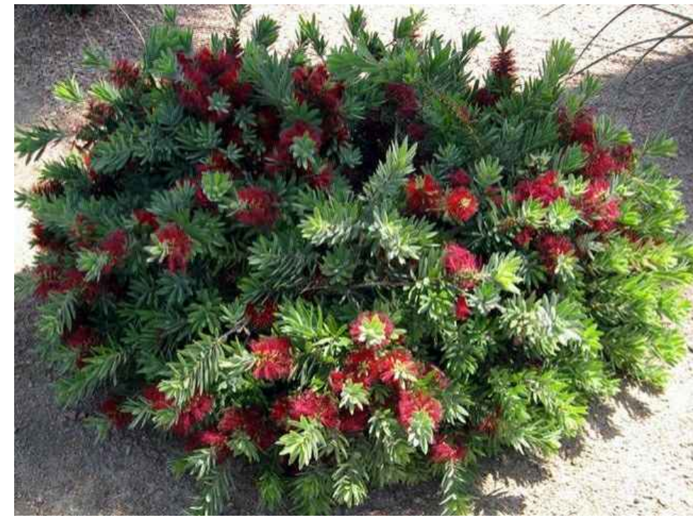
Callistemon viminalis 'Little John' Dwarf Weeping Bottlebrush 3'H X 3' W Low Water Use