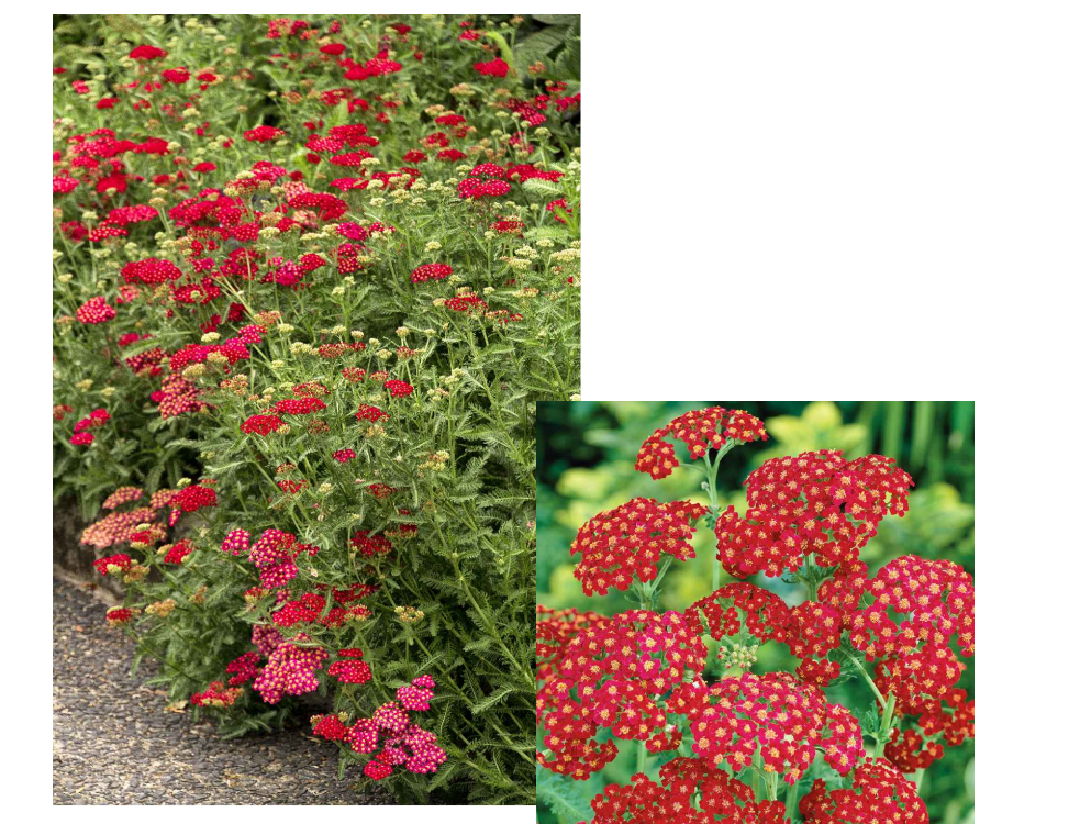
Achillea millefolium 'Red Velvet' Red Velvet Yarrow 1'H X 3' W Low Water Use