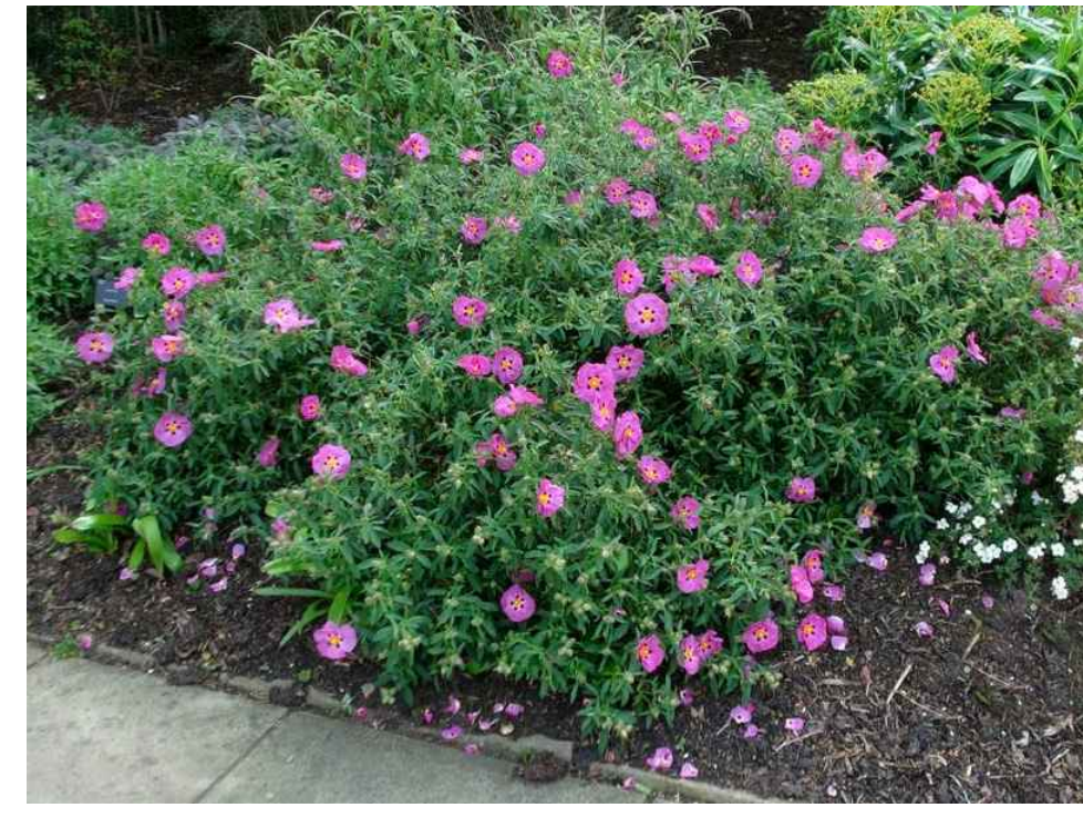
Cistus x. purpureus Orchid Rockrose 4-6'H X 4-6' W Low Water Use