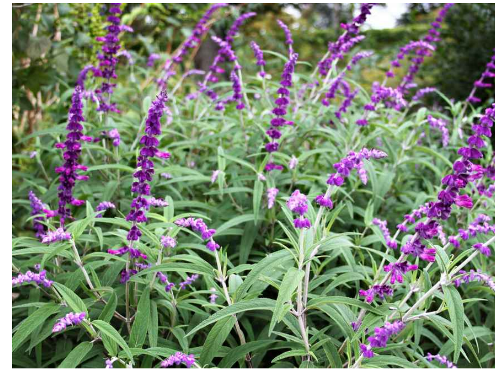
Salvia leucantha 'Midnight' Mexican Bush Sage 3-4'H X 4-6' W Low Water Use