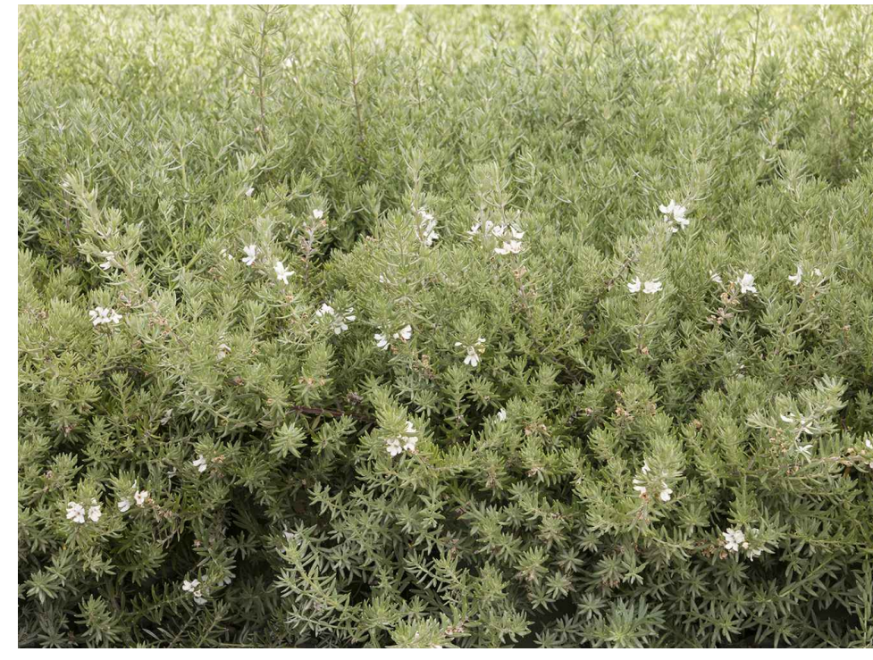
Westringia fruticosa 'WESOG' Coast Rosemary 10-12'H X 2' W Low Water Use