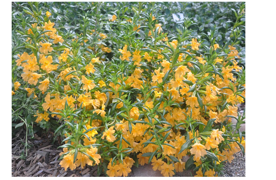
Mimulus aurantiacus Sticky Monkey Flower 1-3'H X 1-3' W Very Low Water Use