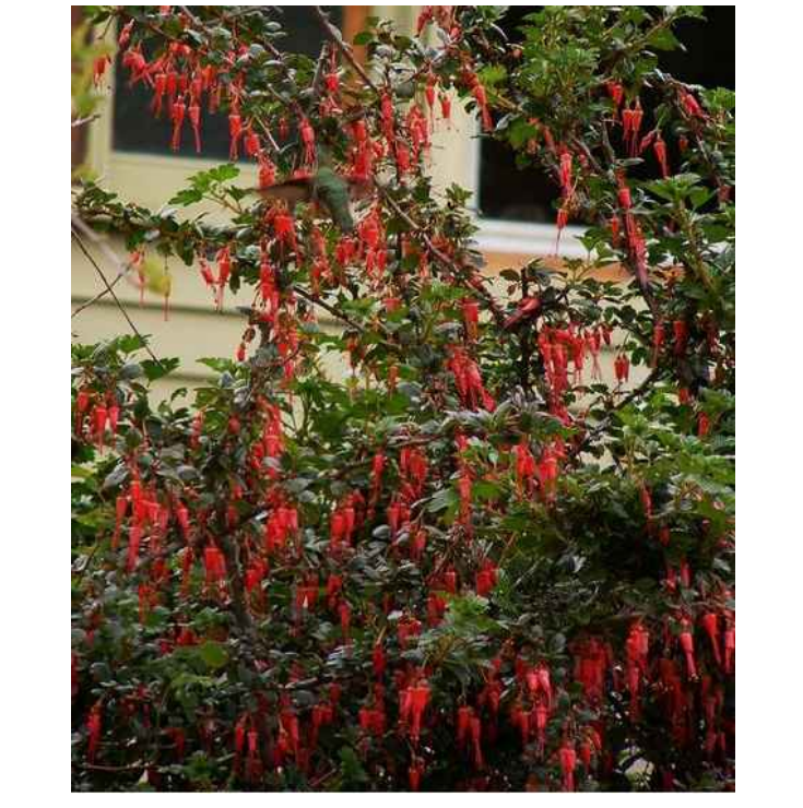
Ribes speciosum Fuchsia Flowering Gooseberry 4-8'H X 4-6' W Very Low Water Use