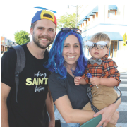
Treats in the Streets Autumn Festival October 24 Attended by 10,000+ people