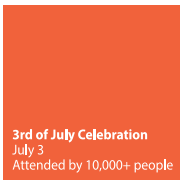
3rd of July Celebration July 3 Attended by 10,000+ people