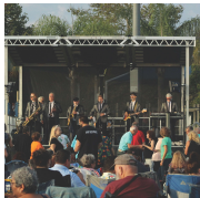
Concerts in the Park Wednesdays June 12 - August 7 Attended by 12,000+ people

City of Orange COMMUNITY PARTNER 2 0 2 4