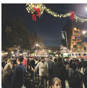
Tree Lighting Ceremony & Candlelight Choir Procession December 8 Attended by 10,000+ people