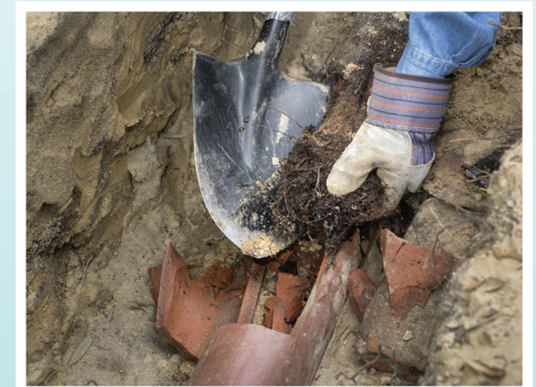
Plumber making repairs on private lateral