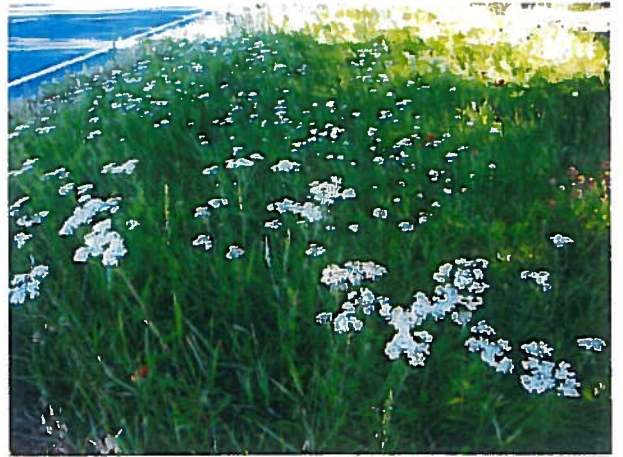
No-Mow Meadow with Yarrow