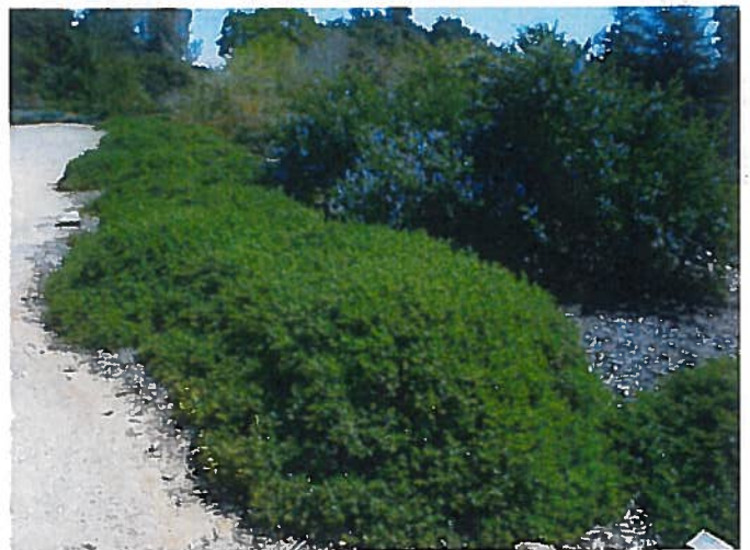
Baccharis p. - 'Twin Peaks'