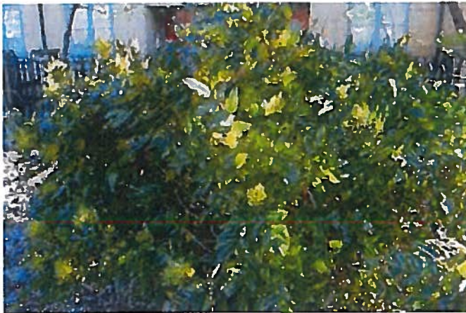
Mahonia a. - Oregon Grape