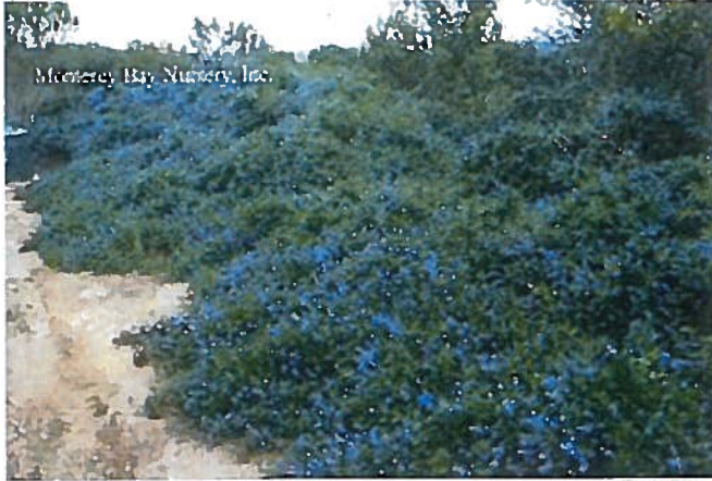
Ceanothus g. 'Yankee Point'