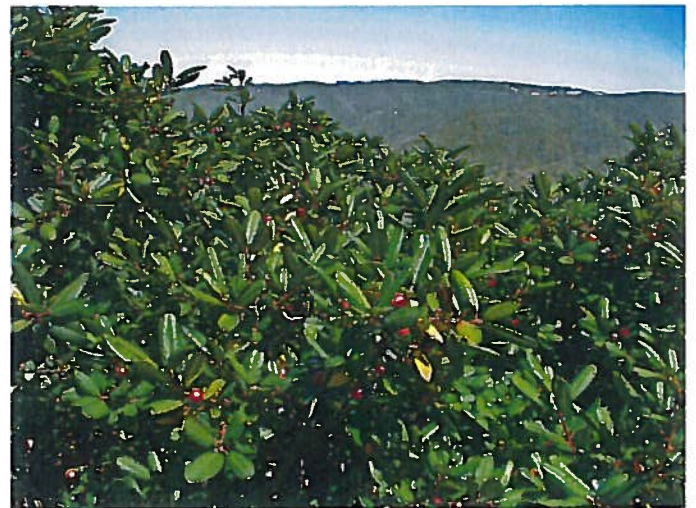
Rhamnus c. - Coffeeberry