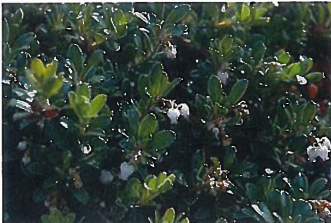
Arctostaphylos u. - 'Point Reyes'