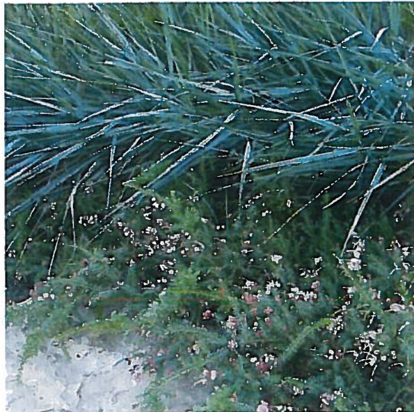
Leymus 'Canyon Prince'