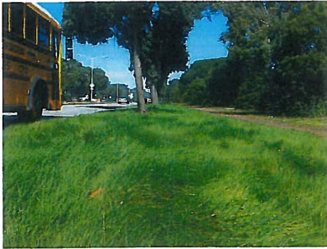
Native Bent Grass - Agrostis p.