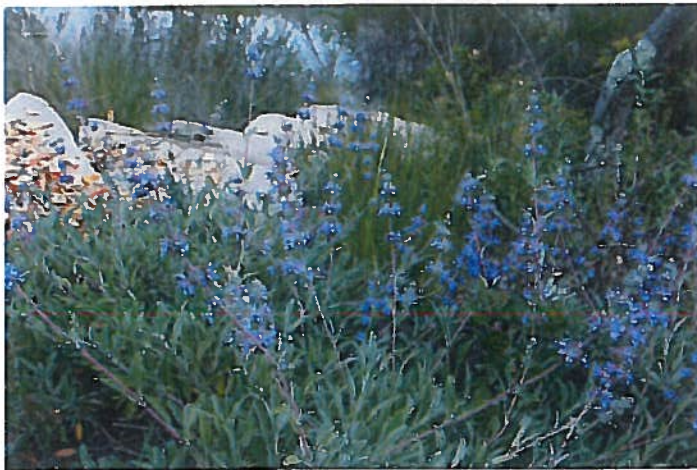
Salvia sp. - Creeping Sage