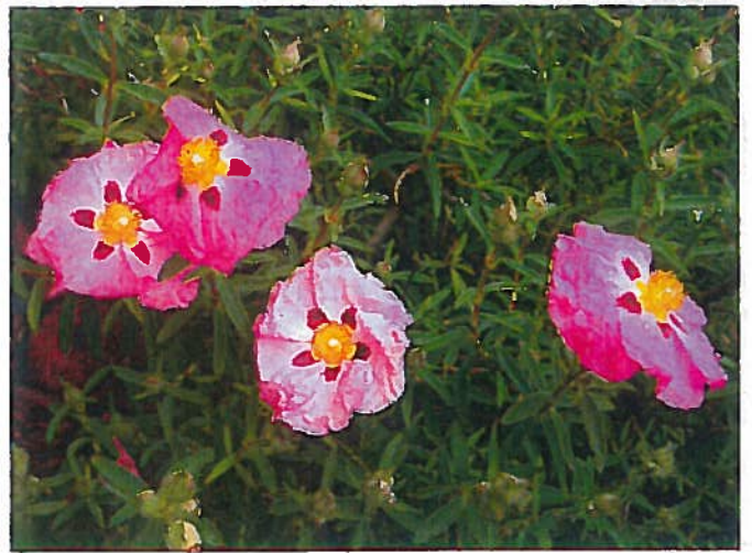
Cistus p. - Rockrose