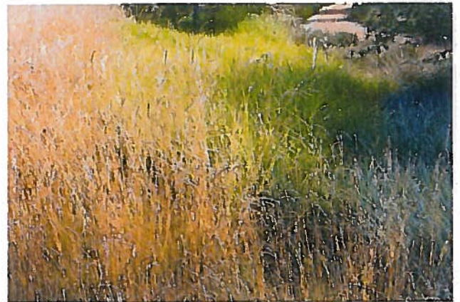
Native Grass Blend