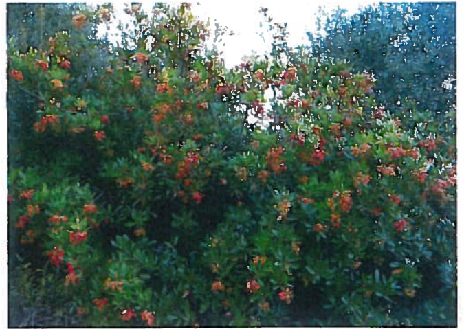
Heteromeles a. - Toyon