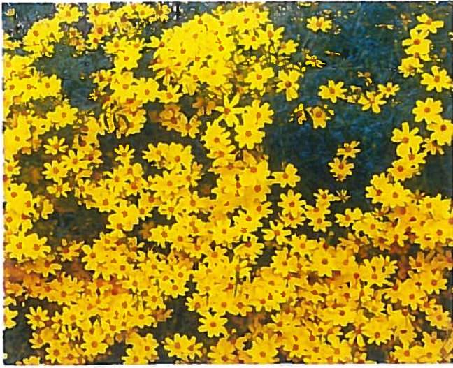
Tagetes l. - Mexican Marigold