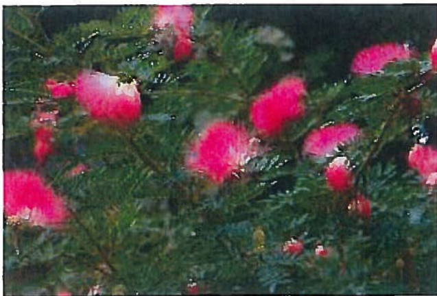
Calliandra h. - Trinidad Flame Bush